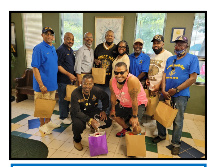
Members of Franklin Lodge 58 donated gift bags for the shelters with grocery store gift cards and kitchenware items.