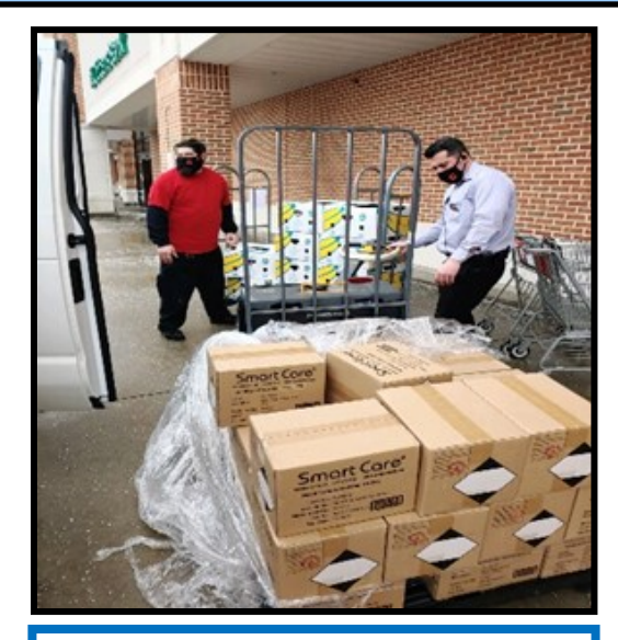
Giant Food Market in Brookhaven made a huge donation of hand soaps and hand sanitizers which were distributed to all the shelters.

Community Action Agency of Delaware County, Inc. is always extremely appreciate of the support that it receives for its clients. This has been even more vital and even more amazing during the COVID-19 Pandemic as the community continues to support our most vulnerable residents during these unprecedented times. Please see some examples on this page of our caring residents and businesses.