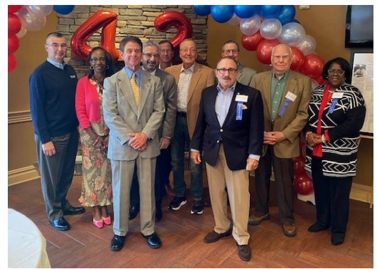
Right - CAADC Board of Directors

Please see Page 2 for a message from our Board President and Chief Executive Officer.